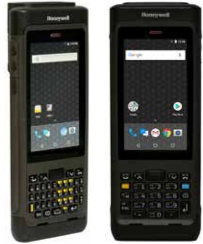
The CN80G ultra-rugged mobile computer provides iron-clad security for U.S. government agencies and contractors, with certifications for FIPS, STIG, and DOD8500.

Built on the Mobility Edge™ platform, the CN80G device offers an integrated hardware and software platform that enables customers to accelerate provisioning, certification, and deployment across the organization. The only platform that offers guaranteed compatibility through Android™ R, Mobility Edge devices promise a product lifecycle extending across four generations of Android to maximize return on investment and provide a lower overall TCO.